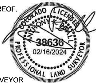
ILLUSTRATION ATTACHED AND MADE A PART HEREOF.